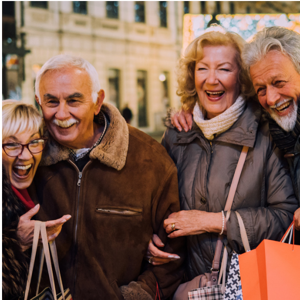
Wishing all a happy and healthy holiday season!